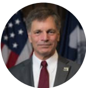
Governor Mark Gordon